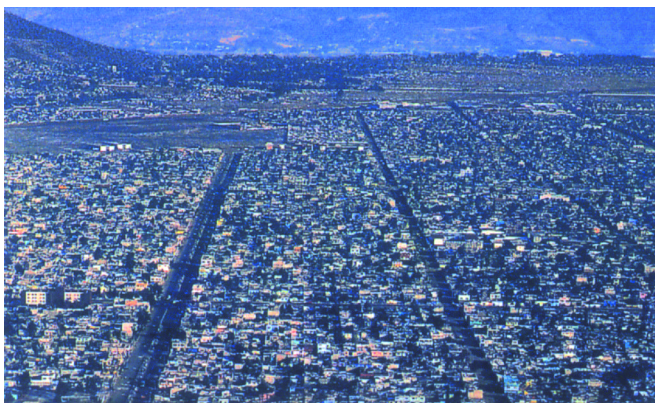
Fig. 2. The environment suffers and people in these areas are badly disturbed by noise, air pollution and vibration. In addition, traffic congestions implies an unnecessary waste of resources.

From the beginning, ITA had 5 Working Groups (WGs): Standardization, Research, Subsurface Planning, Cost-Benefit studies, and Contractual Sharing of Risks. These subjects were all mentioned in the Recommendations from the OECD Advisory Conference in Washington 1970, and are closely related.