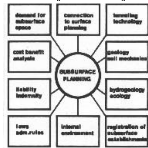
Fig.3. Fields of knowledge connected with subsurface planning

Such a library would probably also be interesting for other groups of readers: local and national administrators and decision makers, journalists and especially for international academic education such as Italy has initiated. Of course, the whole Pocket Library could be bound into one thick text book, with the pocket books as chapters, but there are several advantages with the system of a number of separate small pocket books: it is much easier to find authors for the different sub-