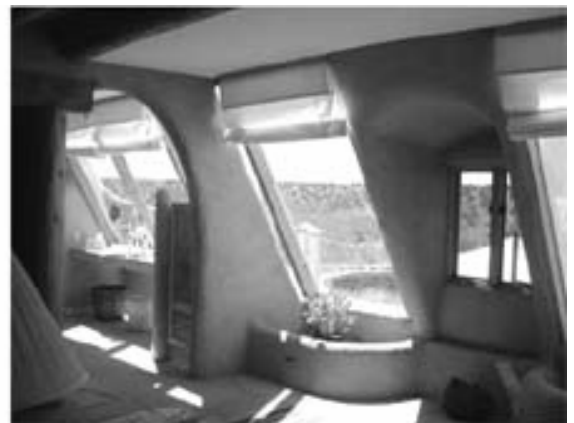
Fig 3 Typical Pleasant Well-lighted Interior of Earth-Sheltered Houses (From Hall, 2004)

Both of the interiors in Fig 3 are of earth sheltered houses created by mounding earth (and other materials) over the structures. Both use the thermal characteristics of massed earth combined with an orientation to collect and store solar heat.