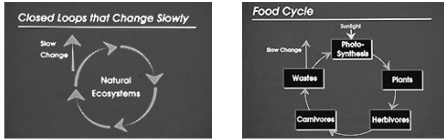
Fig 1 Natural Ecosystems and Food Cycle (From ComTech, WFEO)